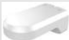
DS-2CD1294ZJ Wall mount