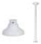
PFA109+PFB220C Mount Adapter + Ceiling Mount Bracket of Mini Dome & Eyeball Camera